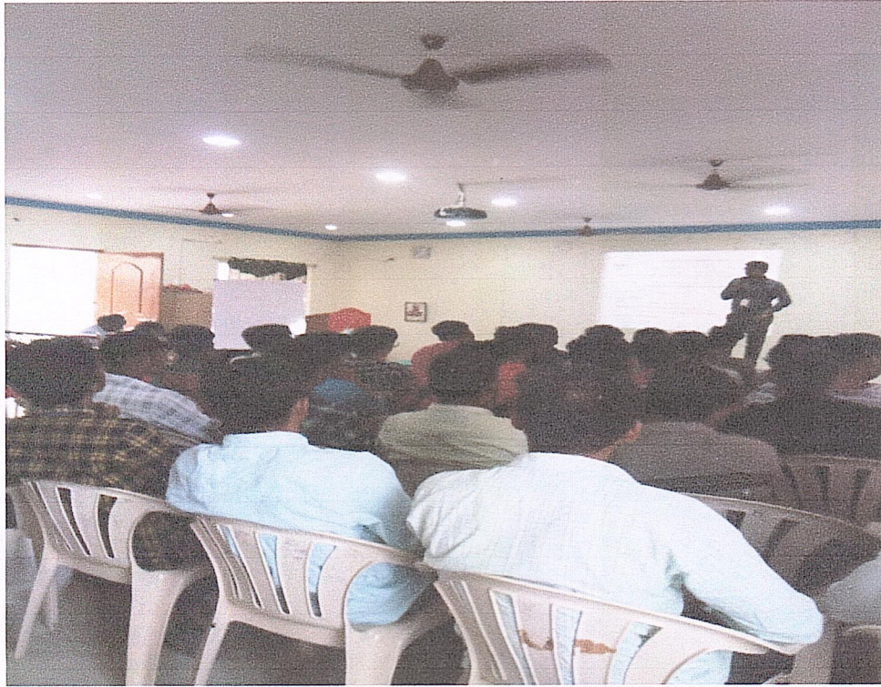
A One Week Coaching Program on “Pharmacist’s Competitive Exams”

Mobile: 9848498714 / 9951420612 | email: prins2mam@gmail.com | Website: www.mamacollegeofpharmacy.ac.in